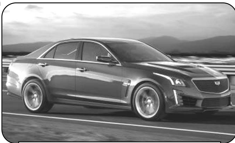
The 2016 CTS-V as being offered by Ian Allan Motors

Future models will be developed as both LHD and RHD, and available with Diesel power plants. Ian Allan Motors are also a Corvette and Camaro Dealer.