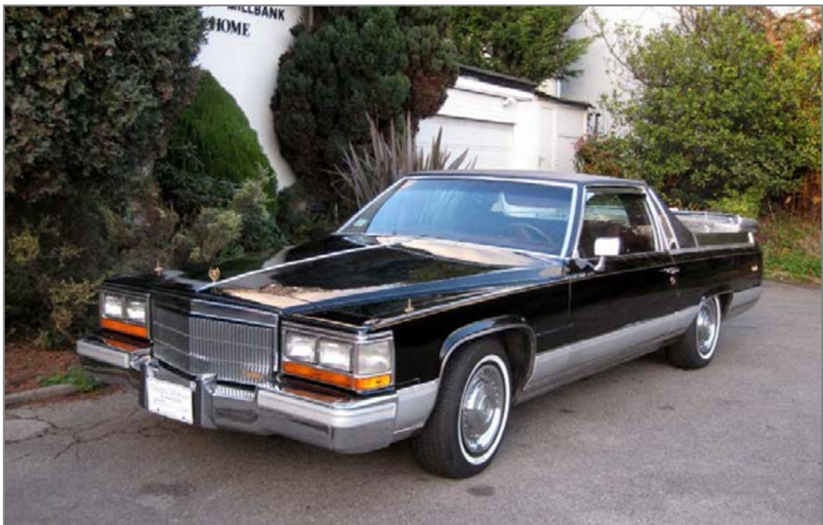
Our Chairman's recently imported 1982 Hess & Eisenhardt Flower Car