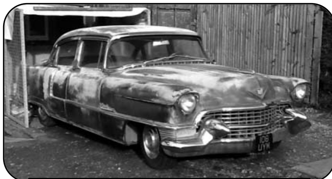
One of Ian Gross's '55s – a bit 'original'