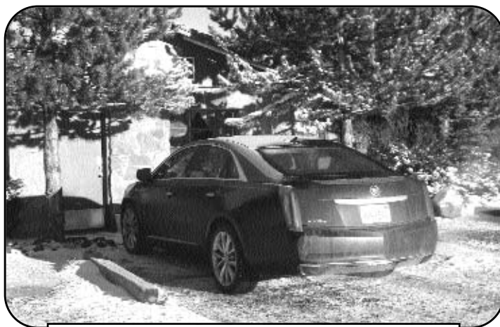
The XTS caught in the snow when in Williams

should. So we took it for a drive, about 30 miles. I kept getting warning messages mostly about the power steering which I could feel was heavier than usual. Then the weird happened..... message telling me to lower the drivers window then close it again followed in turn by all the other windows but hey, the power steering was back to normal. I seem to recall GM and Microsoft having an exchange years ago where GM suggested if Microsoft made cars you'd have to shut and open Windows to get it going again, perhaps they've decided to go down that route. Well after a 30 mile circuit I stopped the engine and it started again, so to celebrate we put it through the car wash and it was pristine black again. Next stop Tombstone.