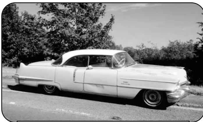
A beige 1956 Sedan belonging to Ian Gross