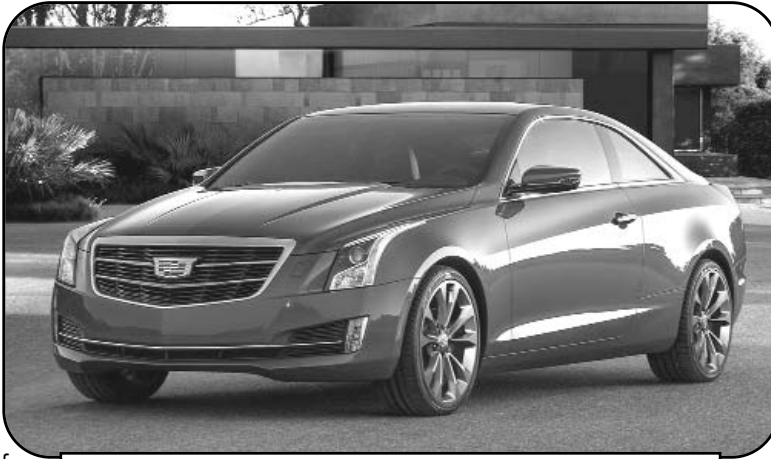
Another of Ian Allan Motors offerings – the 2016 ATS

As always, many thanks for the contributions – a regular supply is essential for the magazine and much appreciated by other members. I am still very short of pictures of members' cars – Ed