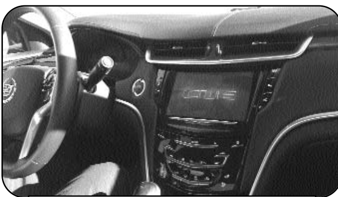
A very stylish modern dash – all at fingertips

After a night in the hotel just down the road from Boot Hill we set off for the town – Damn car wouldn't start again. Another jump start and a call to the rental company, it was a 100 mile round trip to Tuscon airport to swap cars. We'd travelled 2151 miles in the XTS through a temperature range of 19F to 84F and other than the duff battery it had been a great car but it was time to part company and try something else..... a grey metallic XTS with black upholstery (You didn't think I was going to have anything else did you?). Our new car had only 5600 miles on the clock but was exactly the same as the other one except it didn't have a CD player. Fortunately, I have an iPhone, yes it was a surprise to me too, an inheritance following my son's upgrade to the next generation.