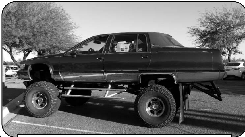
A Fleetwood Brougham 'Monster' spied by Phil Hole in the States