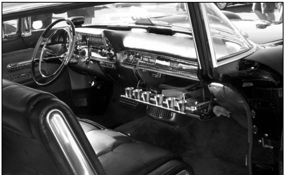
The opulence of a '57 Eldorado Biaritz at the S-W Nationals in the US

Please supply details and photographs for website – and s.a.e if photos required returned