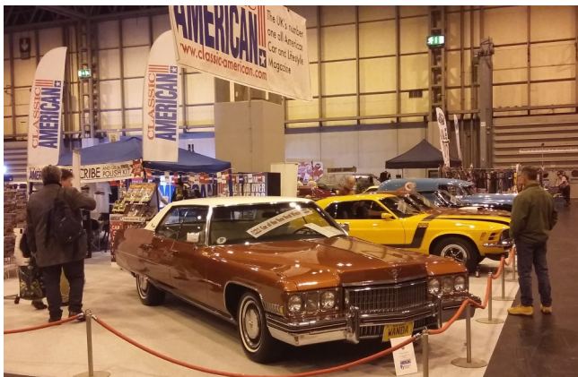
On the Classic American Stand at the NEC