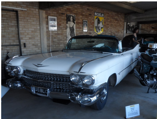
The '59 Eldorado Biarritz is now in the Caister Castle Car Collection, near Great Yarmouth

The car itself looks in a poor state - the door bottoms look very rough and I don't know if it even runs as the museum attendants told us most of the engines had been removed and all fluid drained from most of the exhibits, so it doesn't look as if this Cadillac will be 'on the road' in the near future.