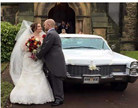
He's all spruced up for the wedding .....and the car looks good too.

It took me a further 3 months with the help of family and friends, to get Alfy roadworthy and tidied up for the wedding. We even made the local newspapers. If you Google "north east couples romance was fuelled by classic american car" you can see the coverage. It's true to say, if it wasn't for Alfy we wouldn't have found each other. My dream car is a 1955 but Alfy has become part of the family now so he'll be with us forever.