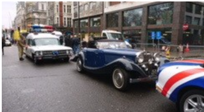
Cadillac Roadster on Parade

When the view in the mirror is spooky... Who ya gona call?