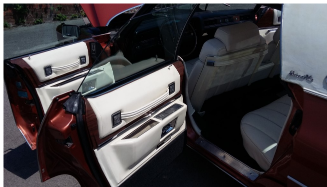
White leather—acres of it