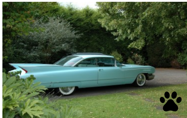
Greg Horn's 1960 Series 62 Coupe